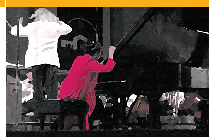
Above: Windows of the World Production at Redlands Bowl

Amazon #1 Best Seller in Classical Keyboard and Instruments, 2015 Notable New Releases, ArkivMusic, January 2015 Memorable Concerts of 2013, San Francisco Examiner Sacramento Talent Magazine, Cover Story, February 2012 Top 12 - What is Remembered in 2009 SF, Net News Publisher/World News Los Angeles International Liszt Competition, Budapest Category Roy M. Rubinstein Award, Manhattan School of Music, NY Bettingen Corporation Grant, Manhattan School of Music, NY New York Recital Debut Award, Artists International Inc., NY Grant Award, Li-Ching Cultural and Educational Foundation Texas Music Teacher's Association Collegiate Concerto Pacific Piano Competition and Festival, UOP, Stockton, CA Manhattan School of Music Concerto Competition, NY San Antonio Young Artist Competition, TX Texas Music Teacher's Association District Collegiate Solo Competition University of Houston Concerto Competition, TX Conroe Young Artist Competition, TX Tuesday Musical Club Competition, TX Young Keyboard Artist Association, MI Chico Young Artist Competition, CA Distinguished Artist Award, Artists International, NY